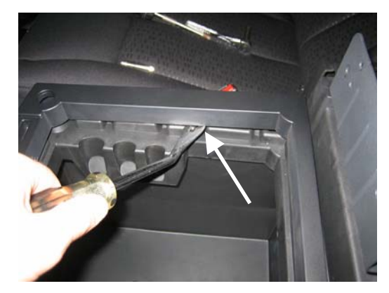
Pry up on accessory pocket trim panel and remove